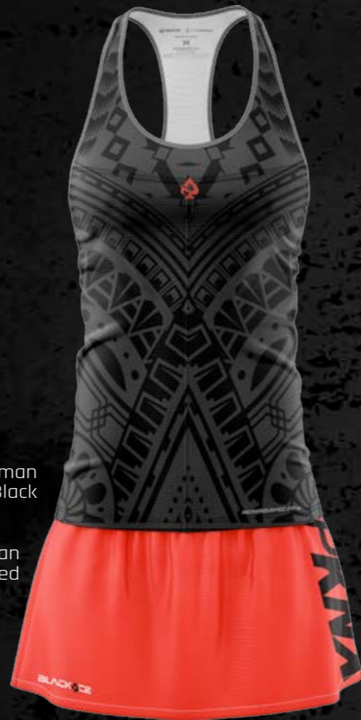
T-Shirt Woman Black Shorts Woman Red