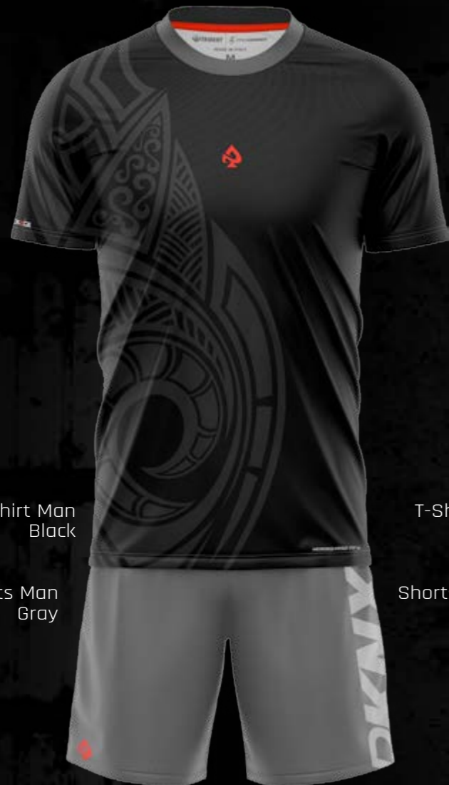
T-Shirt Man Black Shorts Man Gray