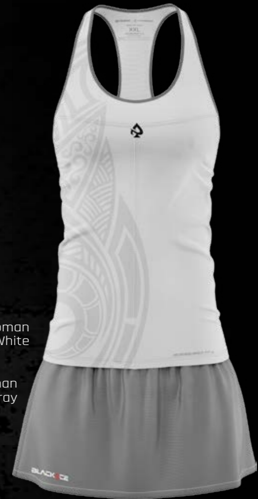
T-Shirt Woman White Shorts Woman Gray