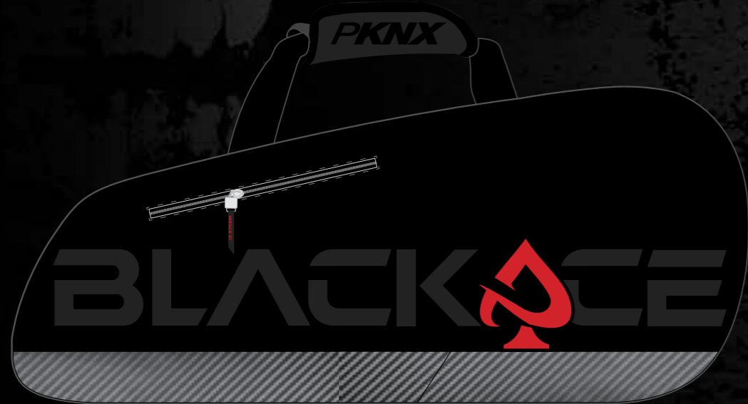
12 Racquet Pack