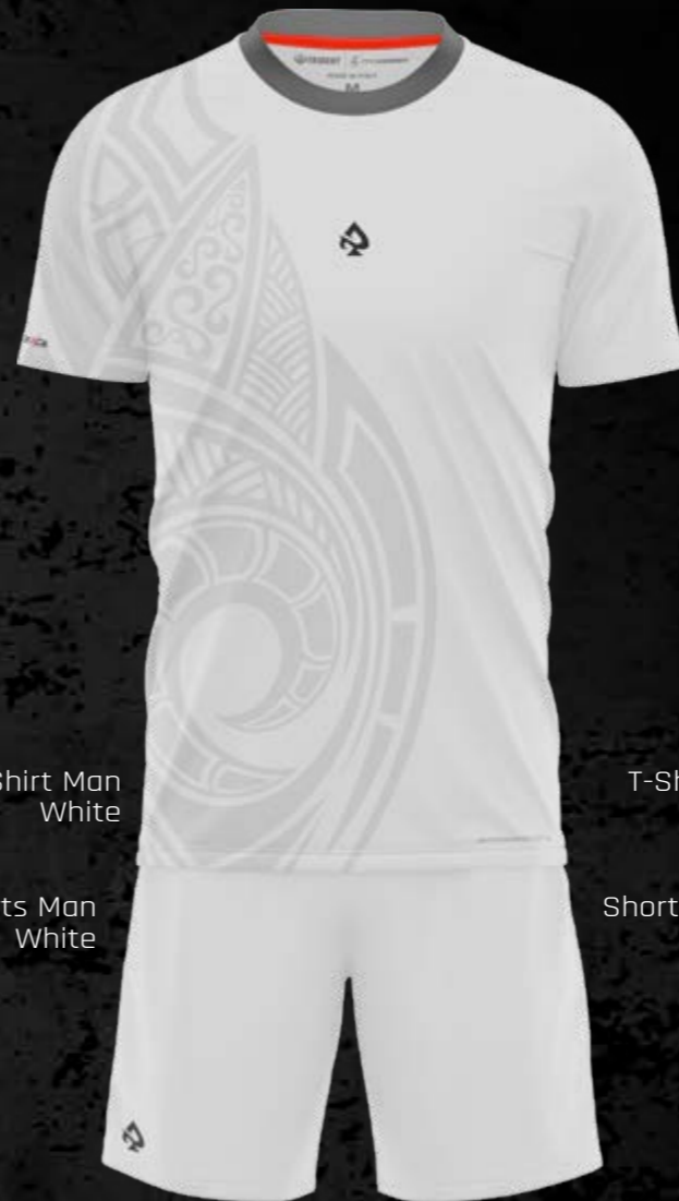
T-Shirt Man White Shorts Man White