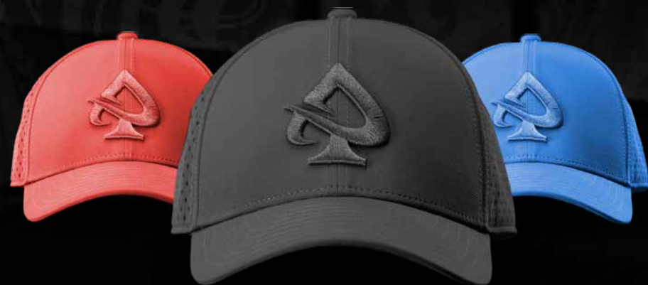
ACE OF SPADE CAPS