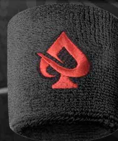
ACE STATION WRISTBAND

Better grip and feel, Long service life and large Absorption capacity of Leather.