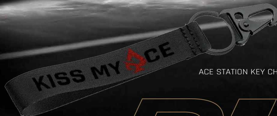
ACE STATION KEY CHAIN